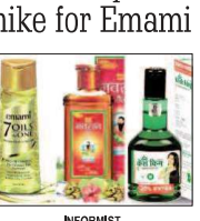
INFORMIST New Delhi

After taking a marginal price hike in April, Emami Ltd will raise prices of some products again in the quarter due to rising costs of critical raw materials, company officials said.