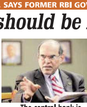
The central bank is printing money even now to finance the deficit, but it is doing so indirectly, Subbarao said